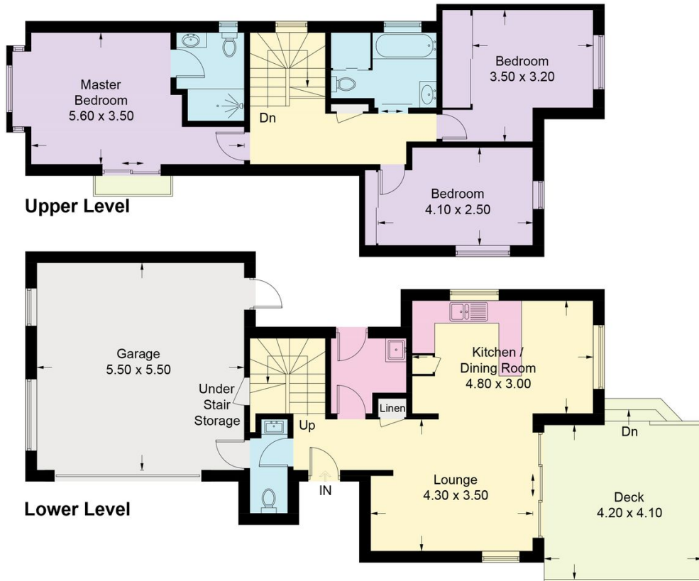
Illustration for identification purposes only, measurements are approximate, not to scale. floorplansUsketch.com © (ID642581)

Approximate Gross Internal Area = 139.2 sq m / 1498 sq ft (Including Garage)